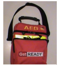
(9"W X 5"D X 11"H)